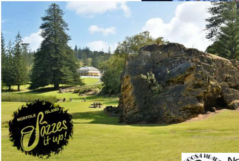
Emily Bay Norfolk Is.